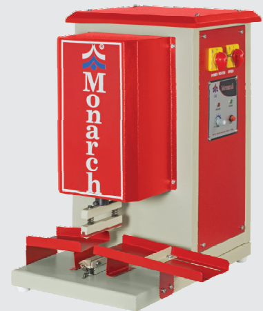
Motorised Liquid Sealer

These machines are especially designed for SIP-UP CANDYS/LIQUIDS, etc. The adjustable stopper helps to set the tube length. It has an adjustable electronic timer with audio-visual sealing indicator.